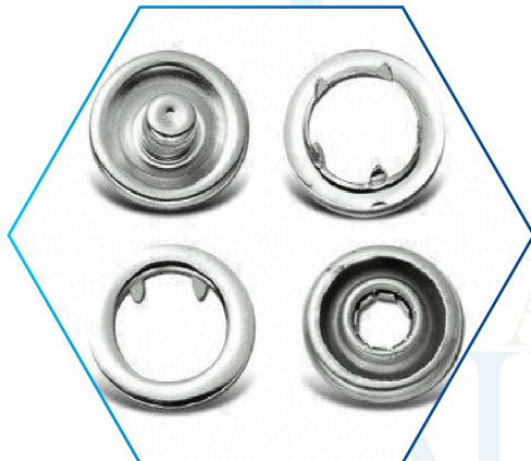
Metal Ring Snap