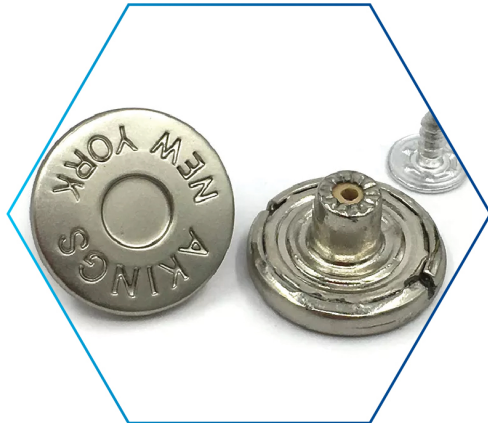
Metal Shank Button