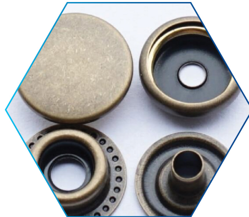
Metal Snap Button